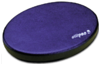
An adaptive switch allows children who lack motor skills to activate toys by touch.

A portion of The Evanosky Foundation's mission statement is to provide support to families affected by a leukodystrophy or other disabling conditions. This is important because families are often under significant financial and time pressure because of their child's disability. Equipment that can improve the quality of a child's life is often cost prohibitive and in many cases not covered by insurance. In order to address this need, The Evanosky Foundation and several Eagle scout candidates from the Boy Scouts of America are working